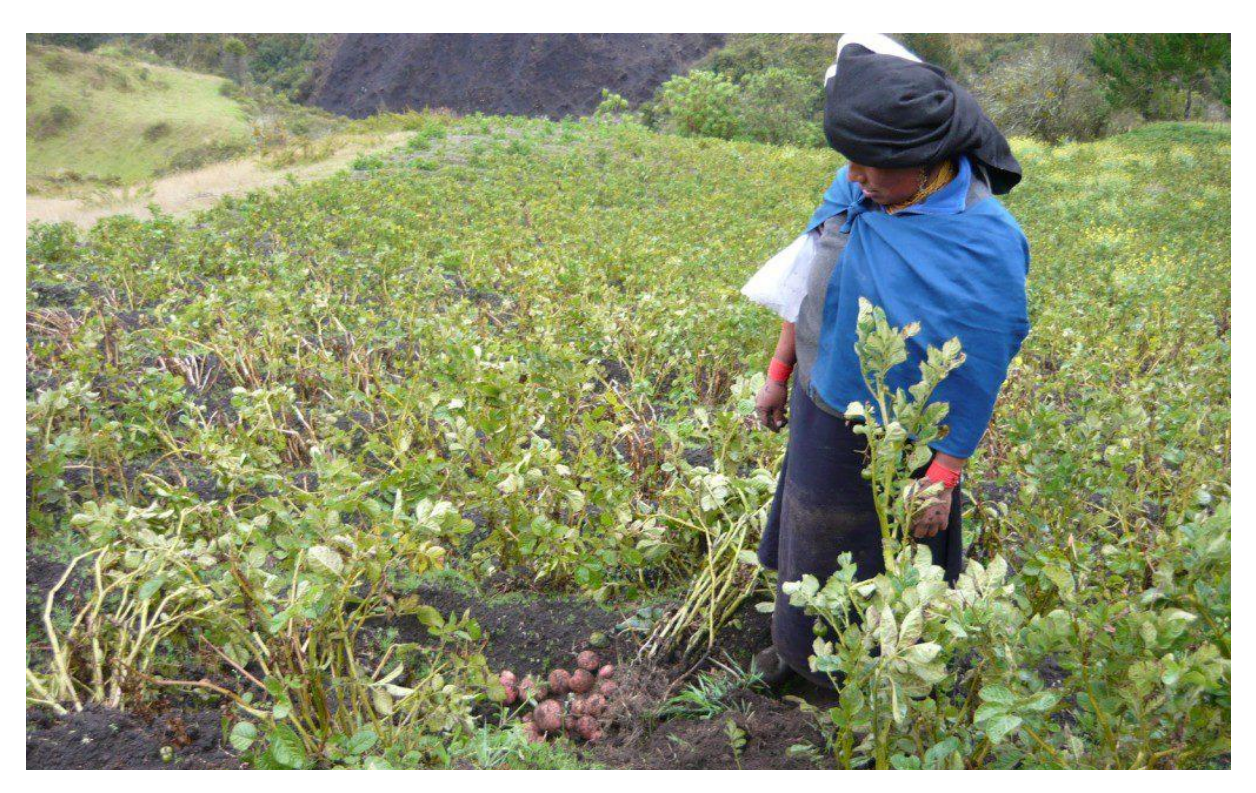
Large-scale Plan Huerto

Plan Chancho (pigs) - Introduced in 2021 by purchasing young pigs to fatten up and sell after six months with profits going to the families.