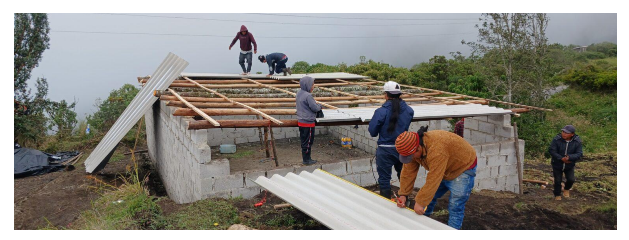
Building the house with the community

In November and December we helped a new family build a house with members of the community also putting in some materials as well as the labour. They were "huasipungueros" (live-in workers on a farm) in another community up in the mountains though due to the economic downturn they had to move with no place to live.