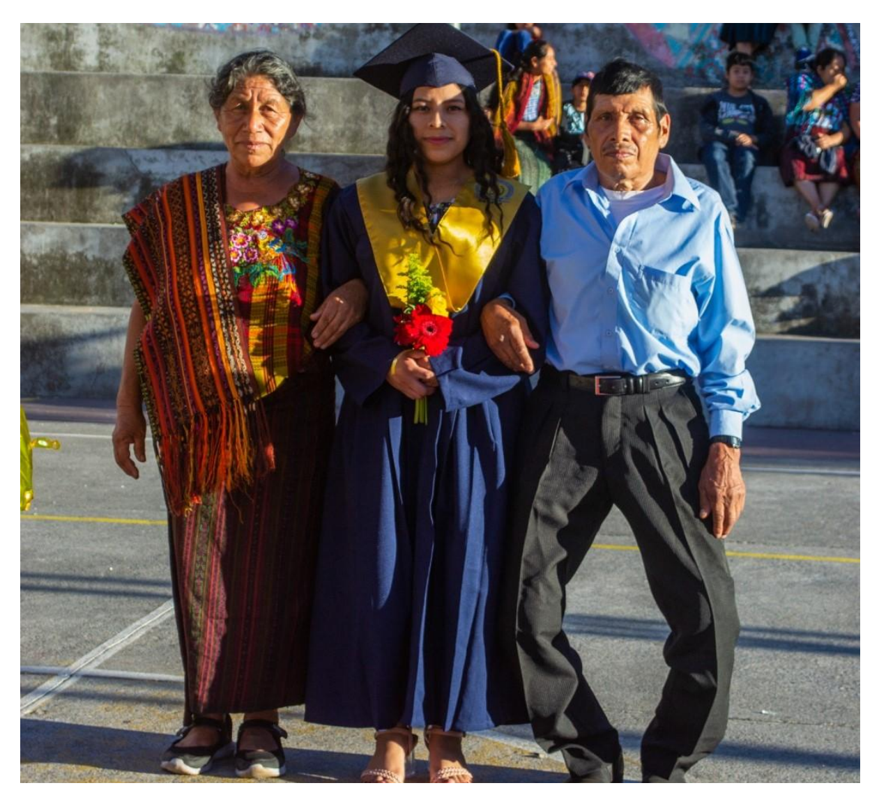
The objective of Fly The Phoenix