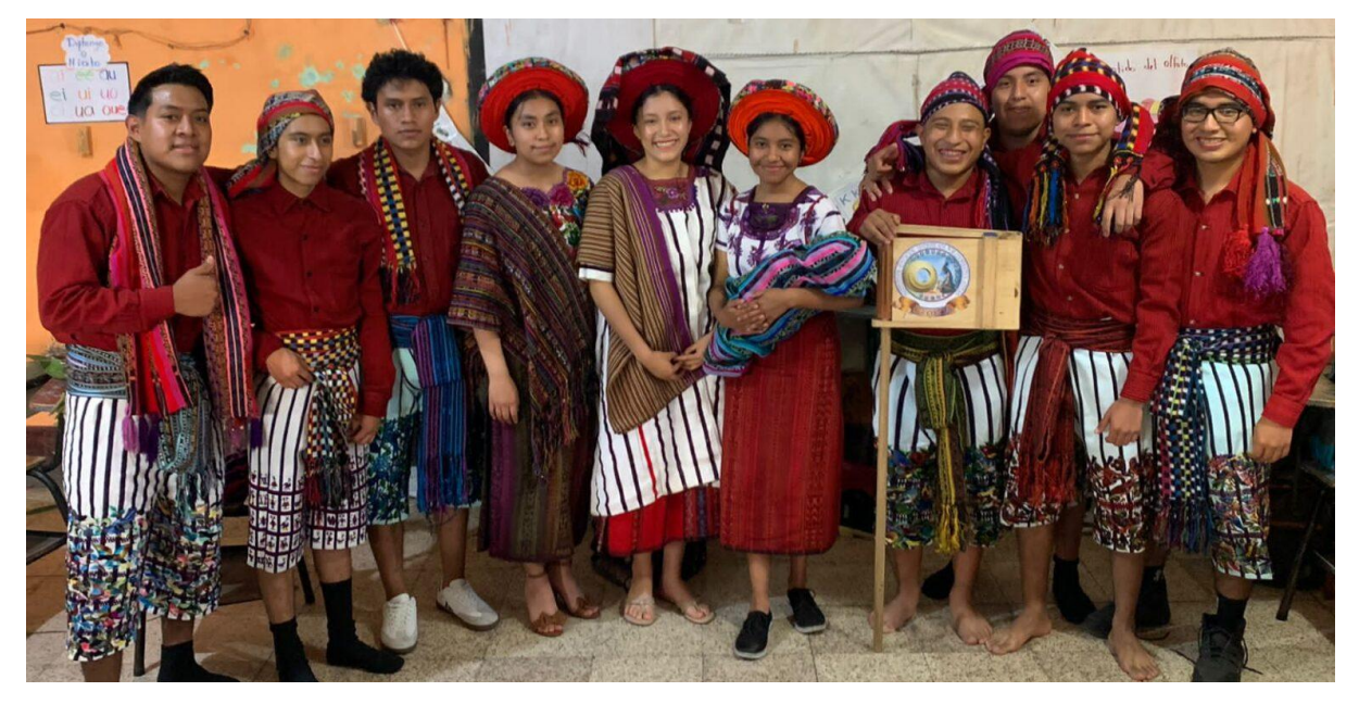
Riiy Rumaam Tz'utujil Po'p

The students were involved in inter-school sports competitions in July and came out winners in several categories and one of our students was chosen to participate in Riiy Rumaam Tz'utujil Po'p, the election of the community queen. She came second.