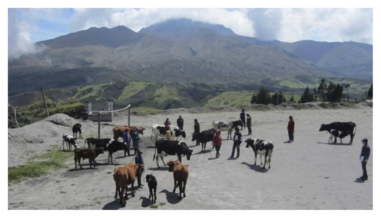
The early days of Plan Moo in Ecuador

Once our current projects are 100% sustainable we will identify further communities in need of education and implement sustainable income plans to cover these costs in the future.