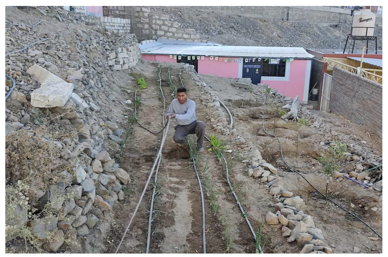
Drip-irrigation school vegetable garden