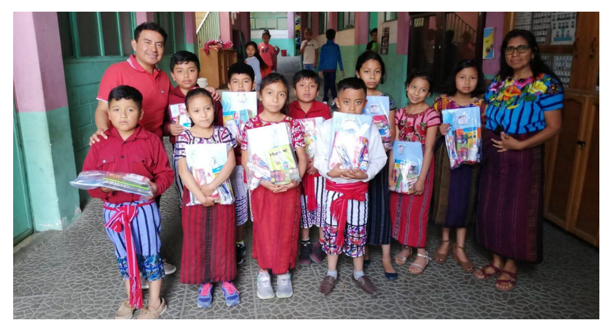
Educational utensils for primary school students

In January we expanded our scholarship programme to include students from other villages around Lake Atitlán. We are also helping primary school students from very poor backgrounds with extra utensils and workbooks.