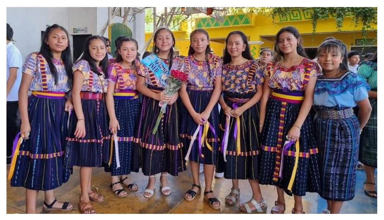
Further education for girls

In January we expanded our scholarship programme to include students from other villages around Lake Atitlán. We are also helping primary school students from very poor backgrounds with extra utensils and workbooks.